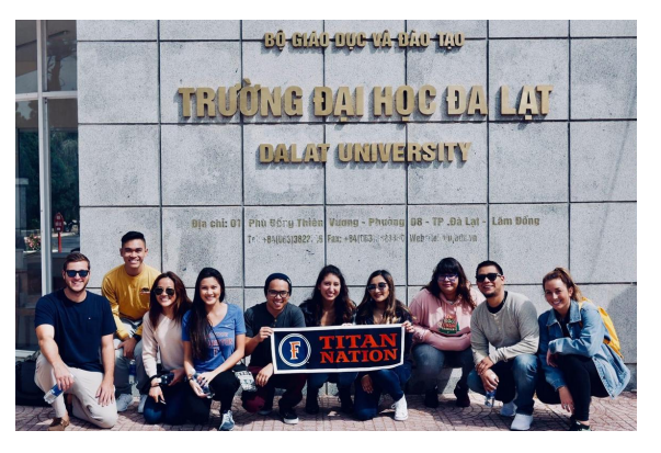
IN VIETNAM WITH HER FRIENDS