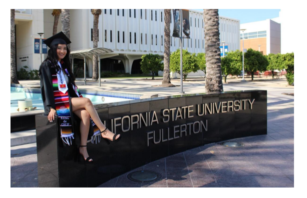
CONGRATULATIONS TO THE CSUF GRADUATE!!!