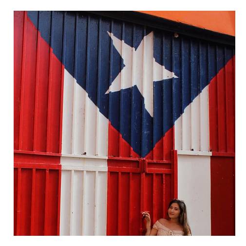
ON THE ISLAND OF PUERTO RICO WITH THE FLAG.