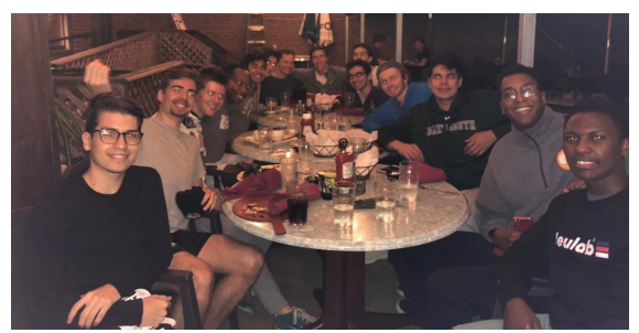
ENJOYING A FAREWELL DINNER WITH HIS SOCCER TEAM FOR GRADUATING SENIORS. (FRONT LEFT)