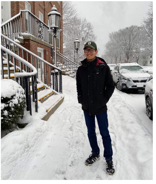
TYPICAL WINTER WEATHER ON THE EAST COAST. THE AVERAGE LOW TEMPERATURE IS AROUND 8°. HOW DID THIS CALI BOY SURVIVE THE WINTERS? A WARM JACKET, GLOVES, AND LOTS OF SWEATERS!

"I am going to be doing what I find interesting and trying to make a difference in my students' lives. I'll understand what they are going through and their home situation."